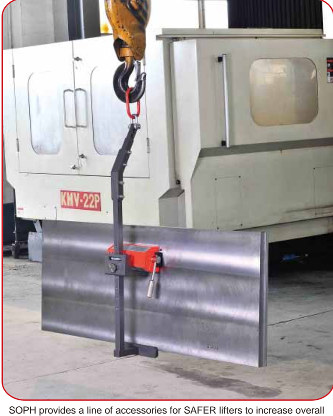
SOPH provides a line of accessories for SAFER lifters to increase overall flexibility during use of horizontal and vertical material handling applications. The durable design makes them reliable over time with no required maintenance.